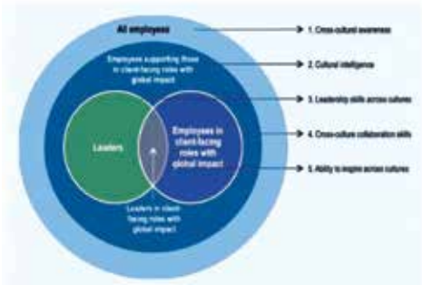
Fig. no. 2. The globally integrated organization