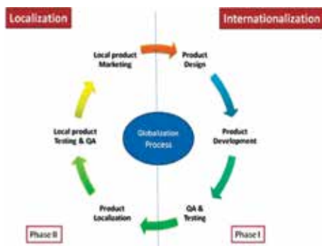
Fig. no. 1. The process of globalization

Business success will depend on management's reaction towards globalization, i.e. the way in which economic organizations will know how to respond to the demands of the world community. [2]