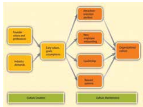
Fig. no. 3. Culture creation and Culture Maintenance in the context of globalization

and cultural identity. Phenomena related to adapting to the process of globalization, internationalization and the so-called “wave” of globalization can be identified as the phenomena of trans-cultural. Organizations are considered a living organism that reacts to changes in the environment and at the same time trying to take advantage of these changes. The modern theory of globalization argue that it comprises two completely contradictory processes of homogenization and differentiation, that there is a complete interaction between localism and globalism, and that manifests the strong resistance movements against globalization processes.