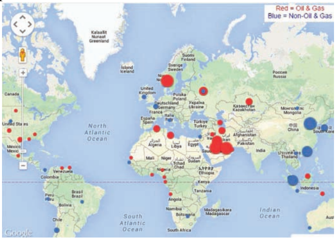
Figure 1. Map of sovereign investment funds world wide

The data published by the Sovereign Funds Institute (SWF Institute), an independent professional organization that tracks the evolution of these funds worldwide, are displayed visually on a map that shows the main areas across the globe where such funds are owned and managed ( Figure 1 ).